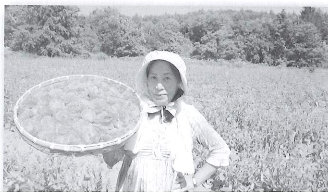
Left: Homeopathic farm in Toya, Hokkaido, Japan.

My next subject is to work together with other health professions (conventional medicine and other alternative medicines) and overseas homeopathic organisations for mastering homeopathic medicine, enhancing the position of professional homeopaths and contributing to the people of Japan with homeopathy.